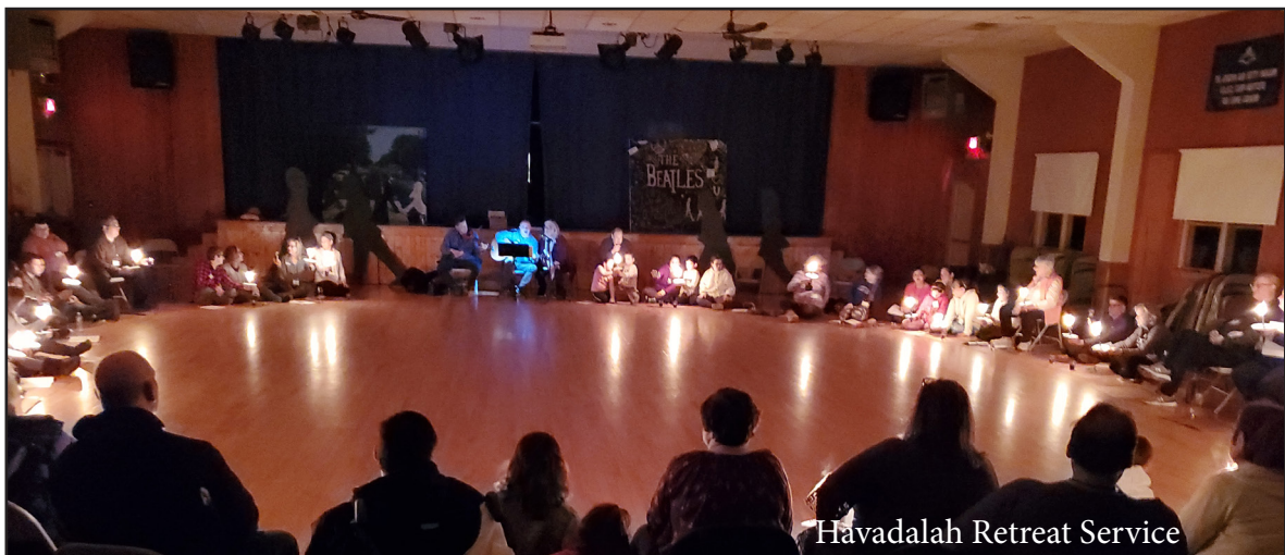
Havdalah Retreat Service

We celebrate High Holidays, festivals and holidays at their appointed times in the Jewish calendar. Other special services include a Music Service, in which congregants learn new melodies to songs and prayers and periodic Healing Services which provide a time of peaceful meditation and prayer for those in need of physical or emotional healing, perhaps because of an illness or the loss of a loved one. These special services promote the feeling of community and intimacy that really sets Beth Haverim Shir Shalom apart.