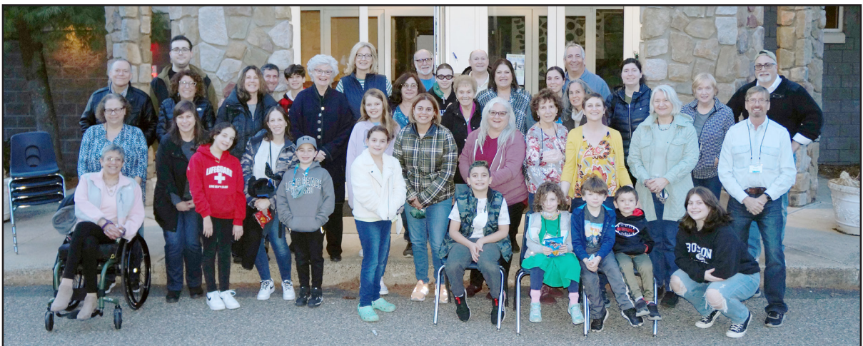
BETH HAVERIM SHIR SHALOM

In the summer of 2007, the two congregations merged to become Beth Haverim Shir Shalom, and today we are thriving. From small beginnings we continue to grow as a House of Friends. From a modest start, we ever seek to be a Song of Peace. Sharing, learning, giving, enjoying, we take all that Reform Judaism has to offer.