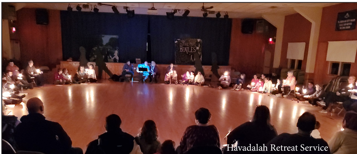
Havdalah Retreat Service

We celebrate High Holidays, festivals and holidays at their appointed times in the Jewish calendar. Other special services include a Music Service, in which congregants learn new melodies to songs and prayers and periodic Healing Services which provide a time of peaceful meditation and prayer for those in need of physical or emotional healing, perhaps because of an illness or the loss of a loved one. These special services promote the feeling of community and intimacy that really sets Beth Haverim Shir Shalom apart.