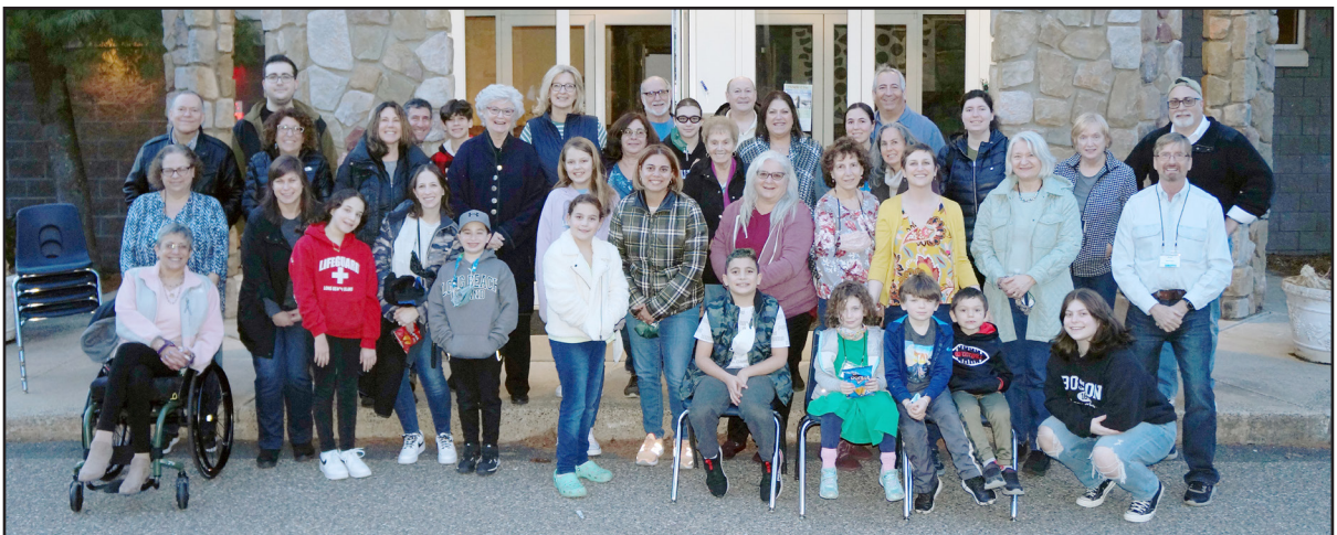
BETH HAVERIM SHIR SHALOM

In the summer of 2007, the two congregations merged to become Beth Haverim Shir Shalom, and today we are thriving. From small beginnings we continue to grow as a House of Friends. From a modest start, we ever seek to be a Song of Peace. Sharing, learning, giving, enjoying, we take all that Reform Judaism has to offer.