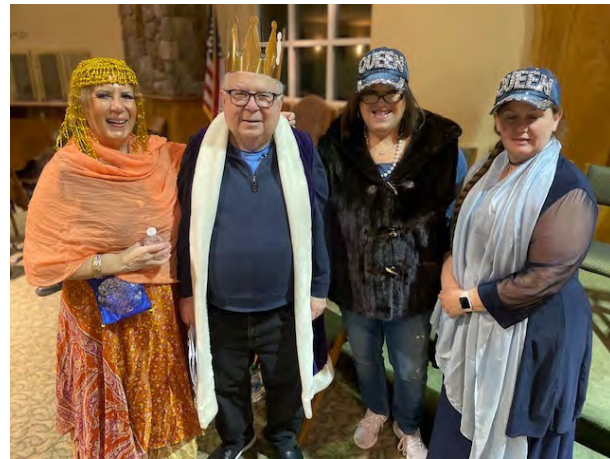
Purim Shpiel and Carnival

Fun times with friends... thanks to Sisterhood's Goods & Services Auction!