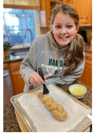
Family School Challah Bake

We hope to see you this summer for outdoor services!