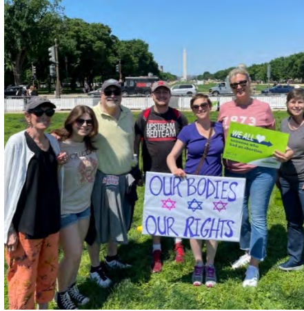
Abortion Rights protest in Washington, DC