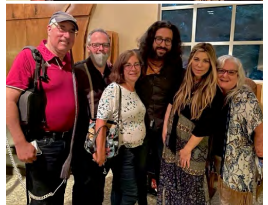
Shavuot with Nefesh Mountain