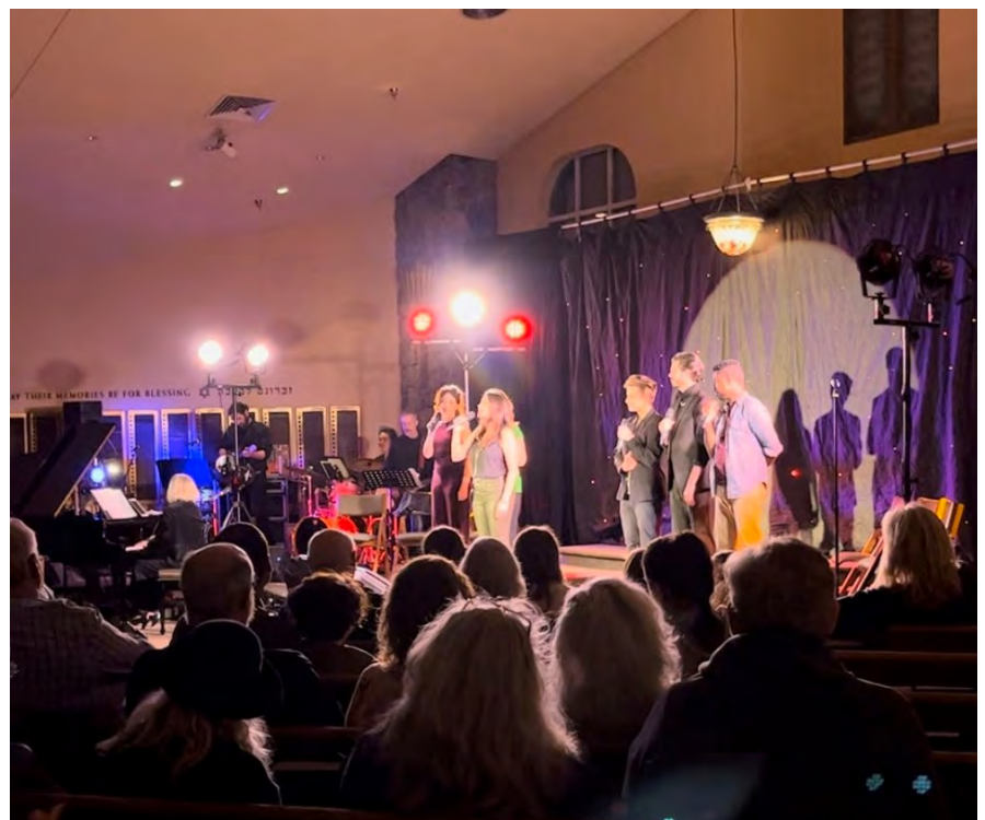
Broadway at your Doorstep