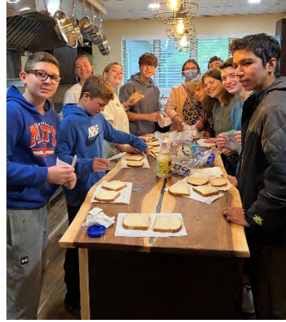
Youth Group in action