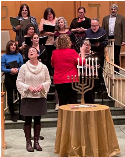
Hanukkah Concert with Temple Beth Rishon