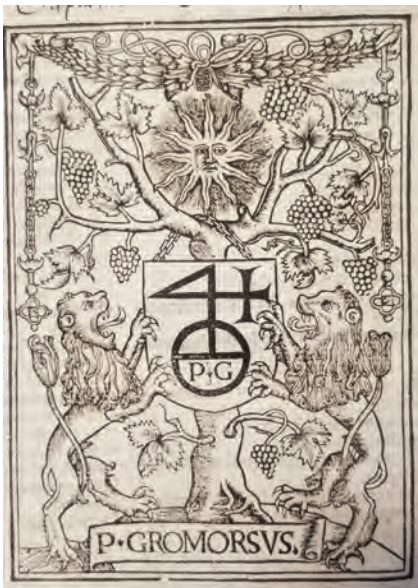
Printer's imprint from the oldest book in the shop, 1525.

New, Used & Rare Books for adults and children Library/Office Supplies Original Art Posters / Graphic Design Stationery, Pens, & Pencils Book Collecting Supplies Historical Ephemera Decorative Paper Bookbinding Supplies Art Supplies Toys, Games, & Gifts