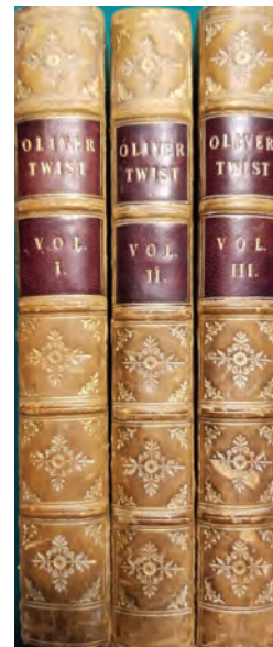
1st Edition of Oliver Twist part of our extensive Dickens collection

New, Used & Rare Books for adults and children Library/Office Supplies Original Art Posters / Graphic Design Stationery, Pens, & Pencils Book Collecting Supplies Historical Ephemera Decorative Paper Bookbinding Supplies Art Supplies Toys, Games, & Gifts