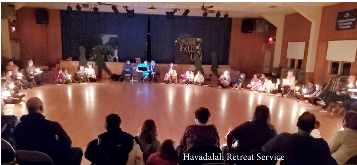
Havdalah Retreat Service

We celebrate High Holidays, festivals and holidays at their appointed times in the Jewish calendar. Other special services include a Music Service, in which congregants learn new melodies to songs and prayers and periodic Healing Services which provide a time of peaceful meditation and prayer for those in need of physical or emotional healing, perhaps because of an illness or the loss of a loved one. These special services promote the feeling of community and intimacy that really sets Beth Haverim Shir Shalom apart.