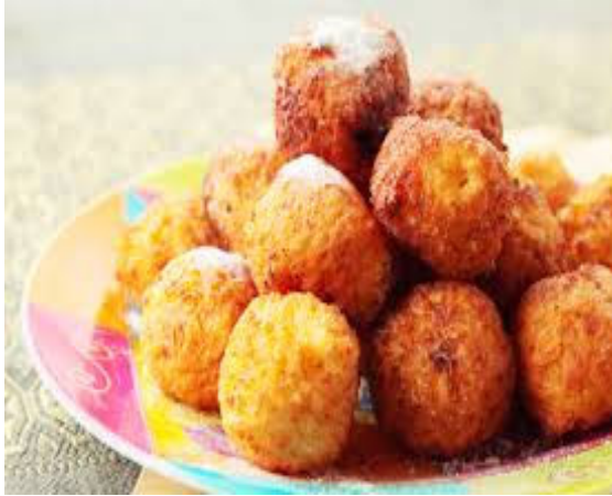
Bimuelos – fritters