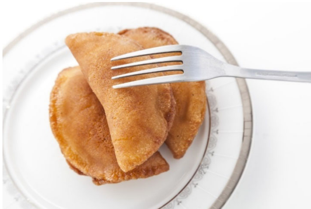
Atayef – cheese-filled pancakes

https://www.myjewishlearning.com/recipe/bimuelos-with-honey-orange-drizzle/ https://www.myjewishlearning.com/article/atayef-stuffed-syrian-pancakes/ https://www.heyalma.com/what-to-make-for-hanukkah-deep-fried-artichoke-hearts-more/