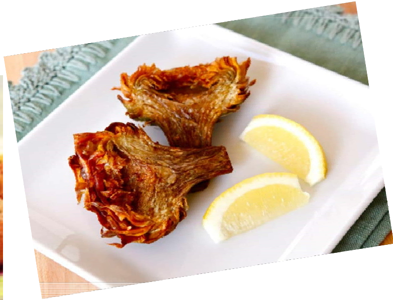
Deep Fried Artichoke Hearts – the name says it all